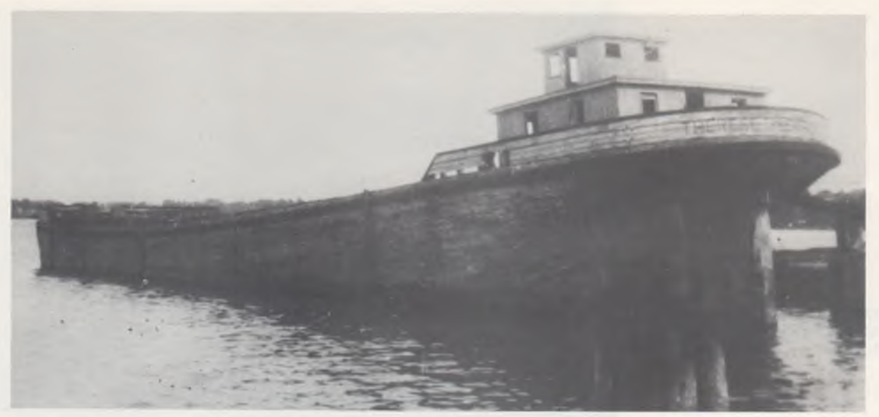
Here, is the only photo of THERESE T. that we have been able to find. It shows her lying derelict at Kingston.