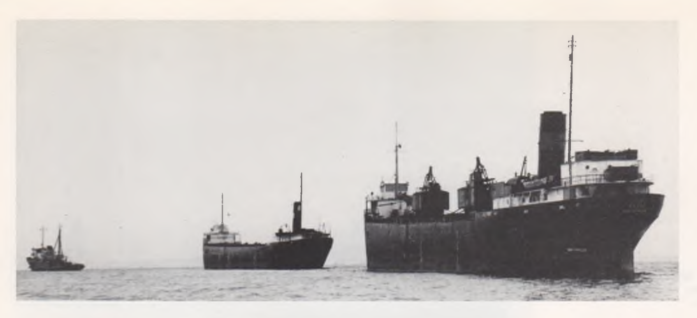
The date is October 11, 1972, as ONTADOC departs Gibraltar, bound for Istanbul in tandem tow with G.G. POST behind the deep-sea tug KORAL.