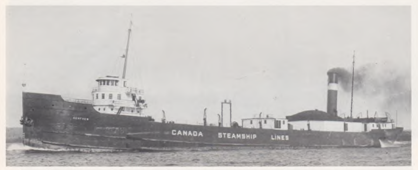
RENFREW is upbound in Little Rapids Cut in this 1927 Young photo.