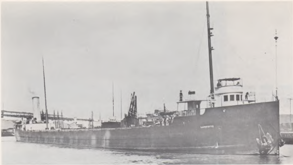
LAFAYETTE, seen in a photo taken about 1902, was typical of the "College Class" steamers which originally towed BRYN MAWR.