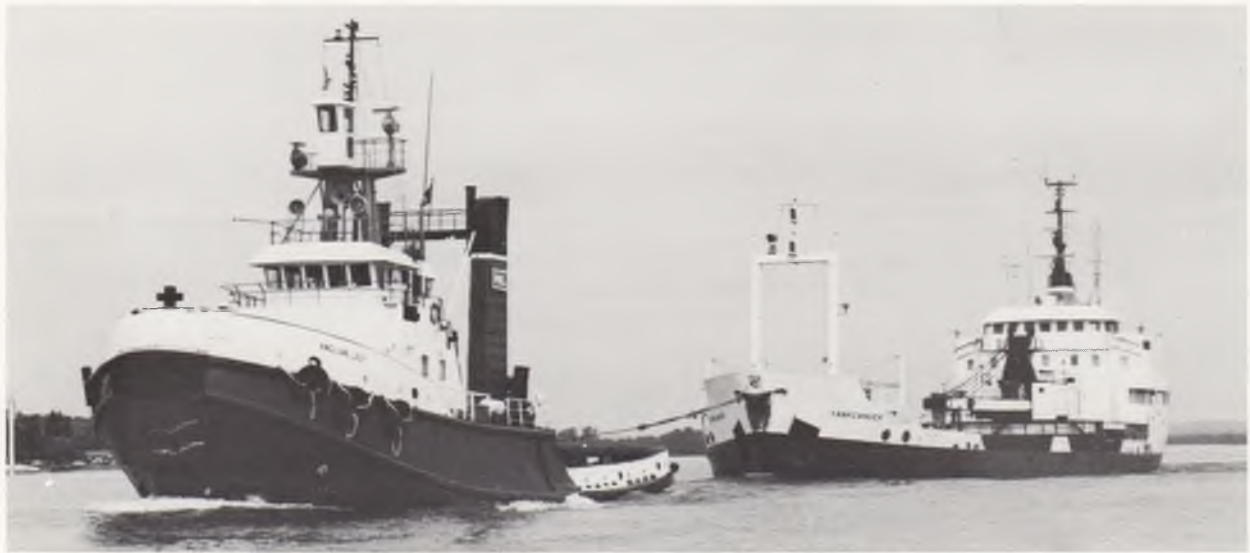
ANGLIAN LADY is downbound in the St. Mary's River on July 12, 1991, towing YANKCANUCK.