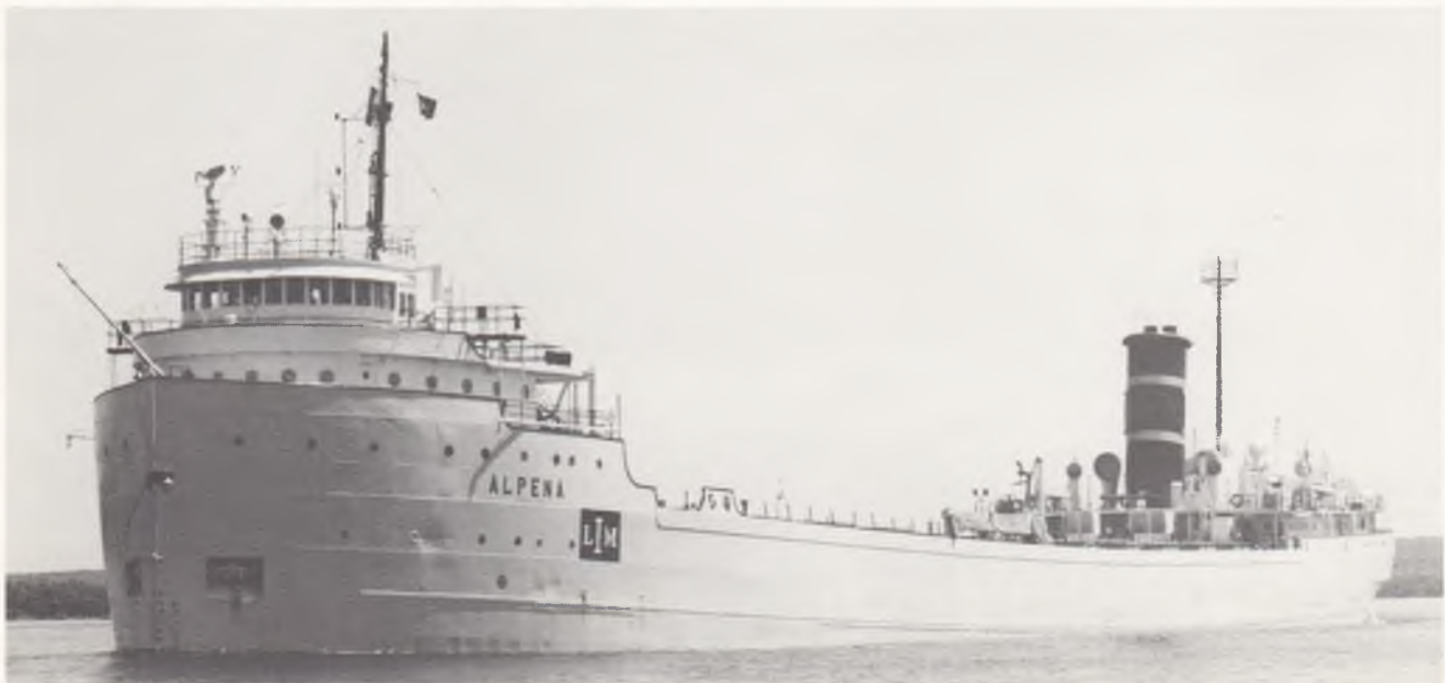
The newly reconstructed ALPENA is upbound in the lower harbour at Sault Ste. Marie in a July 11, 1991, photo by the Editor.