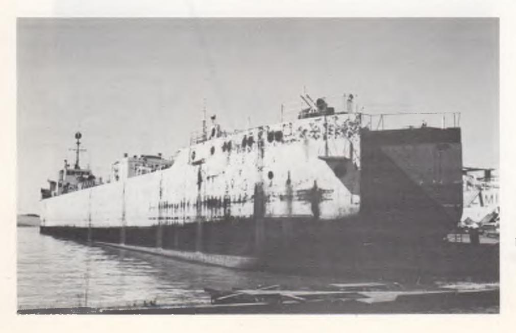
Photo by the Editor, February 9, 1991, shows METIS being converted to a barge at Toronto.

JOHN ROLPH is moored across the end of the West Market Street slip, Toronto. Note Adamson's Elevator, and our "Mystery Ship" in the slip.