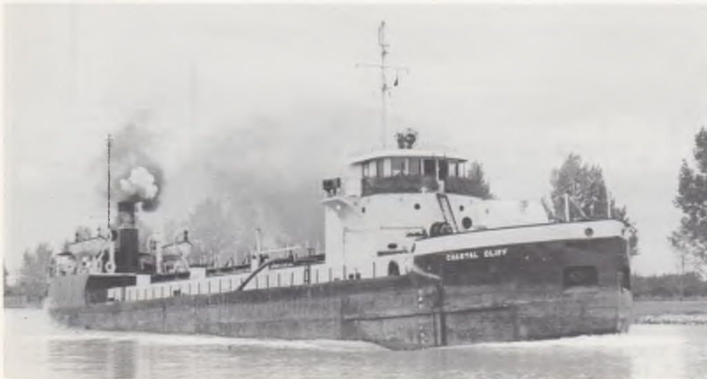
The date is October 22, 1955, and COASTAL CLIFF is upbound in the Welland Canal near Dain City.