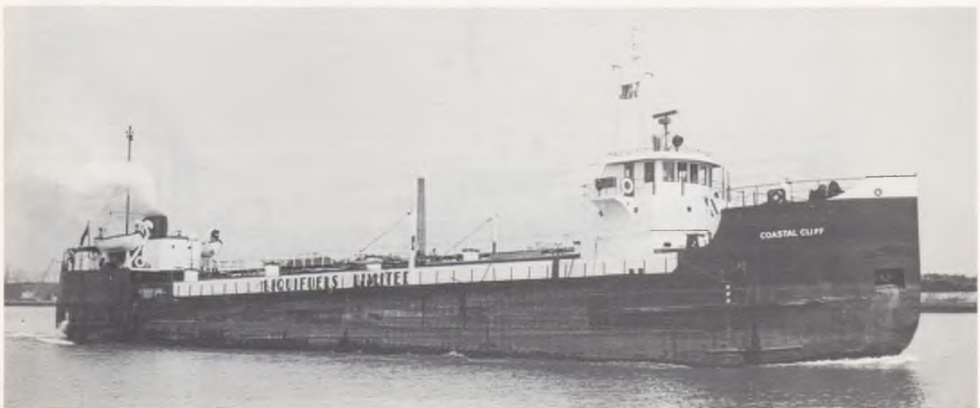
caught COASTAL CLIFF outbound at the Toronto Eastern Gap on September 20, 1959.