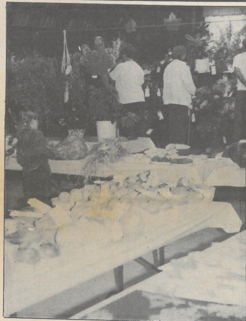
A portion of the main exhibit hall