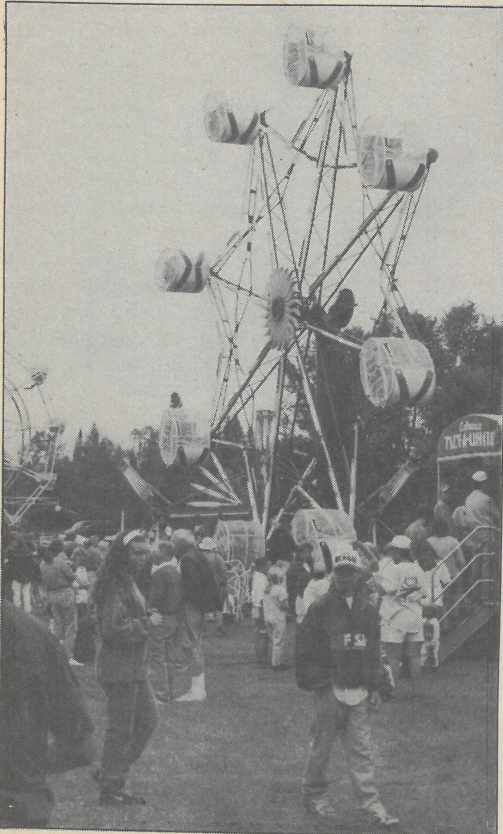
rides by Homeniuk Amusements are an important part of the Coe Hill Fair