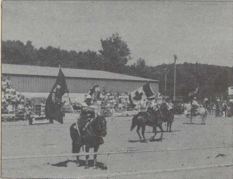
Riders taking part in the Grand entry that began the Rodeo carried flags of Canada, Ontario and the Ontario Rodeo Association.