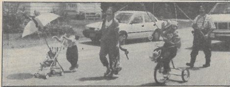
"Gone Fishin'." The Vanier family, marching in the Country Good Times parade in Wilberforce.

Non-residents m book the hall, b do pay a mode fee for using i