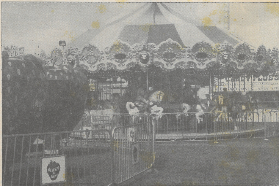
An old fashioned carousel is part of the Midway brought to Country Good Times by Homeniuk Amusements, of Paris, Ont.