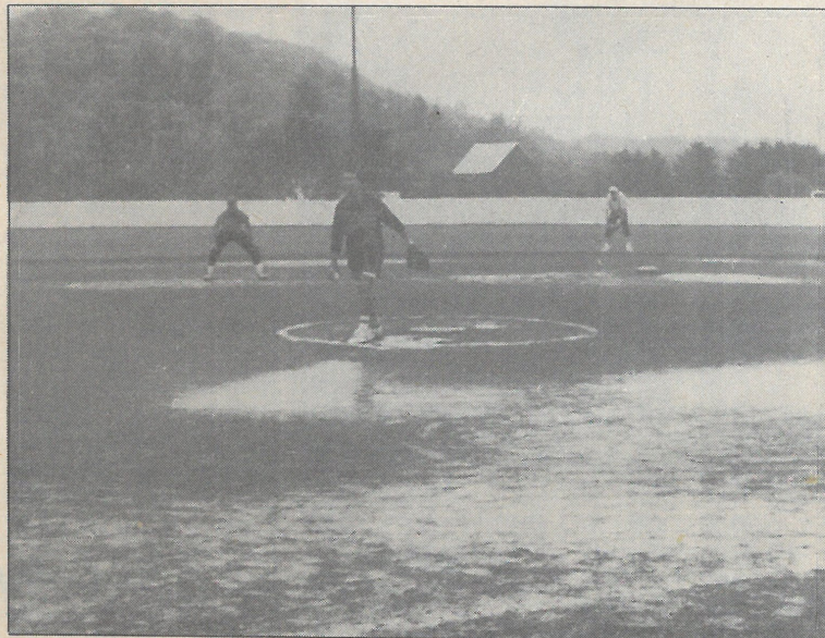
Pitcher, stay on that mound! It's the only dry place in sight! Despite the constant rain, the Legion Three Pitch tournament continued, and finished on time, on July 23.

Eighteen teams entered the tourn- ament. In the first round: * Star Flight de- feated B.K. Outer- wear; * Canadian Tire defeated Wild Thing;