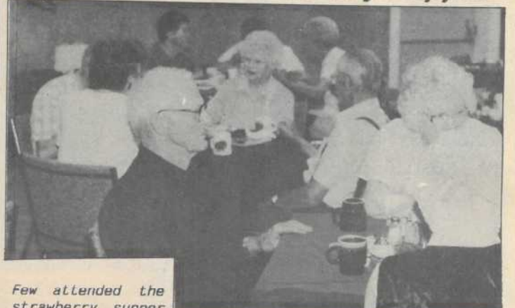
Few attended the strawberry supper on July 1 in Highland Grove. Those who did got a good feed.