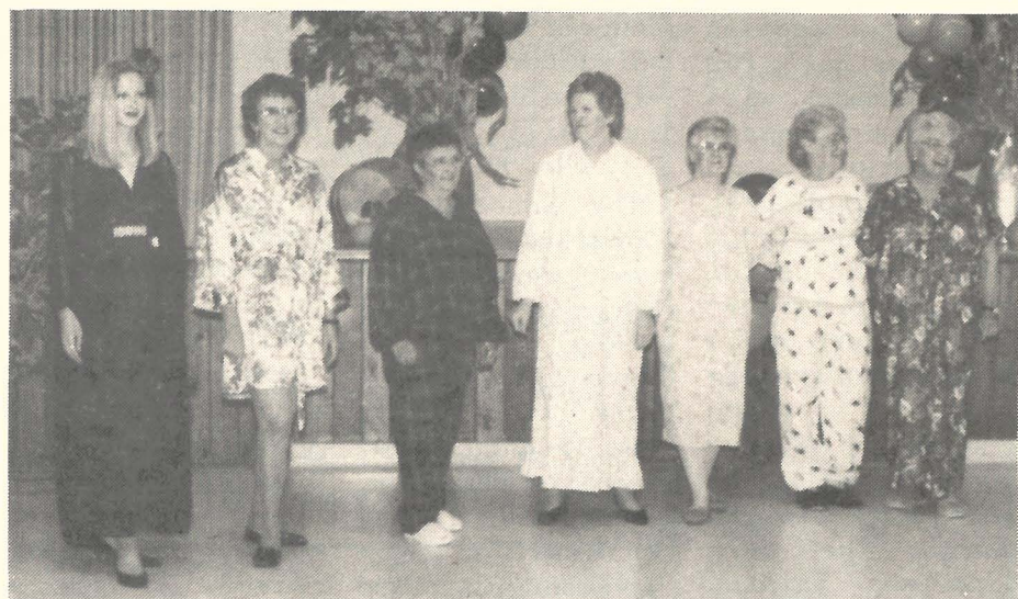
All the models pose together at the end of the Show.