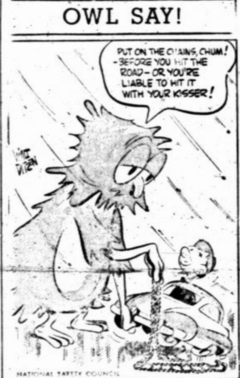
NATIONAL SAFETY COUNCIL

The 150 members of the church find an opportunity for fellowship in the organizations of the church, which include the Methodist Youth Fellowship for the high school young people; the Married Couples' club; the Women's Society of Christian Service, and the Methodist Men's club.