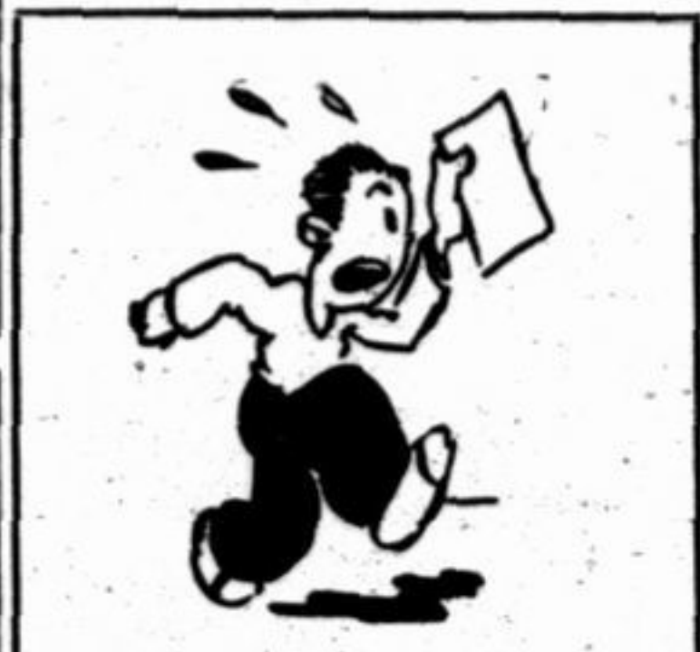
LOOK WHO'S HERE

The bride-to-be was graduated from Wheaton college in June. Her fiance is a mechanical engineer. They will live in San Francisco.