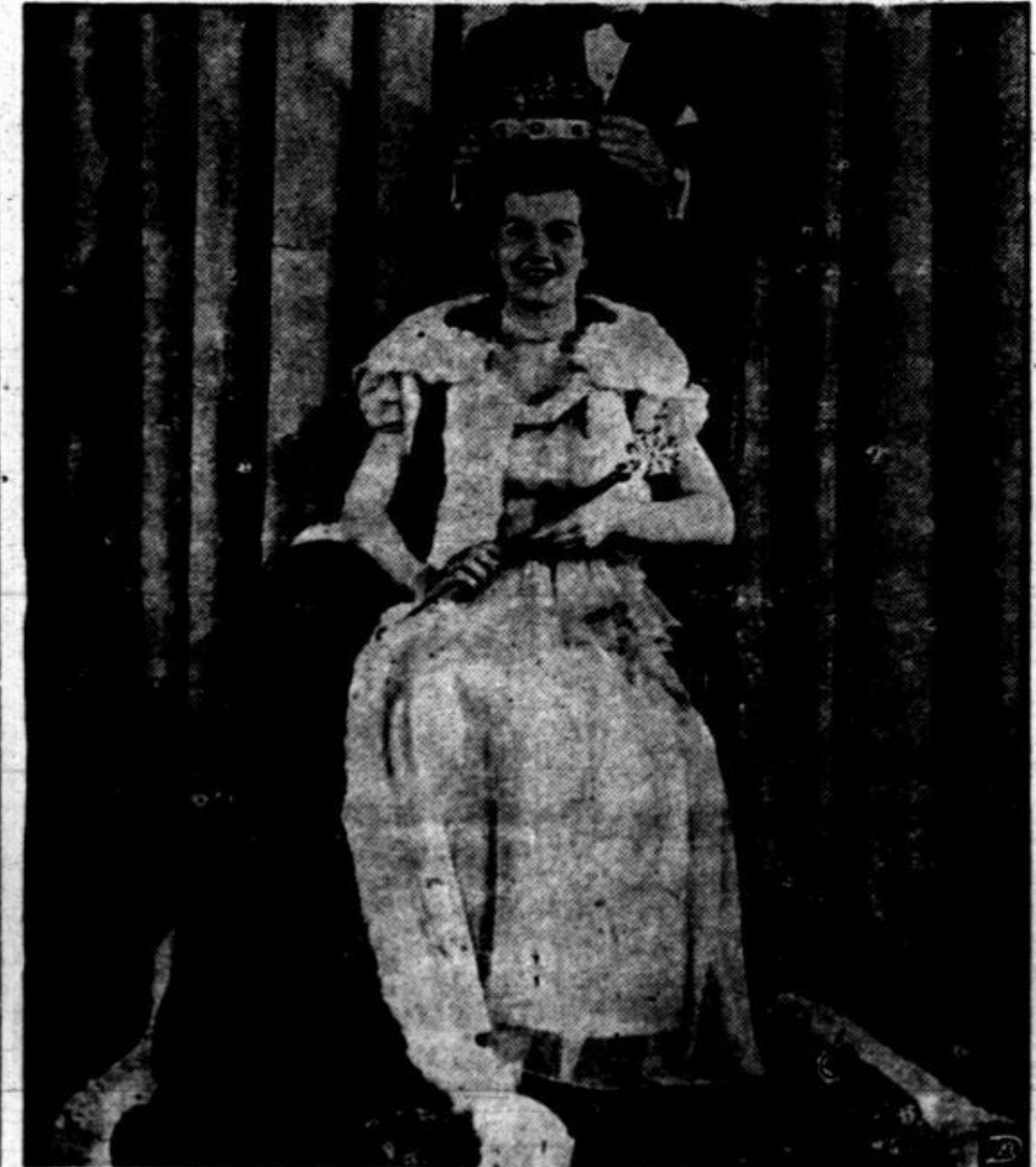
The scene above will be re-enacted when the Queen of the 1950 Illinois State Fair is crowned at the Fairgrounds, Aug. 11. Entries in the contest are being received now.

SPRINGFIELD—Some young lady between the ages of 18 and 24 will be State Fair Queen this year. Will it be YOU?