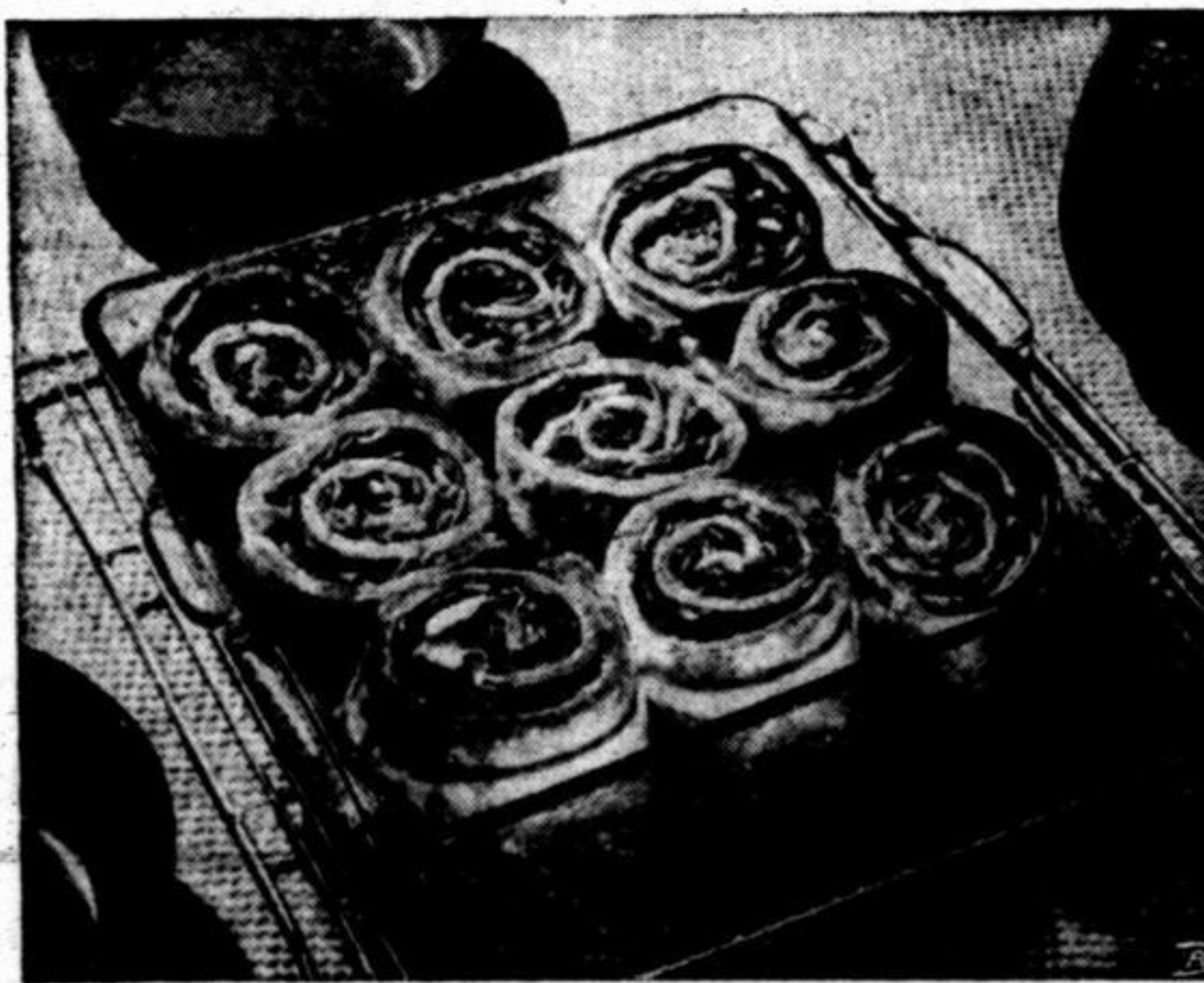
A new way with apple dumplings is to serve them warm with a cinnamon candy sauce.

It's apple time, and time to revive a popular dessert—apple dumplings. Those that mother used to make had whole apples baked in a pastry wrap. Here's a new treatment using flaky biscuit to create apple roll dumplings.