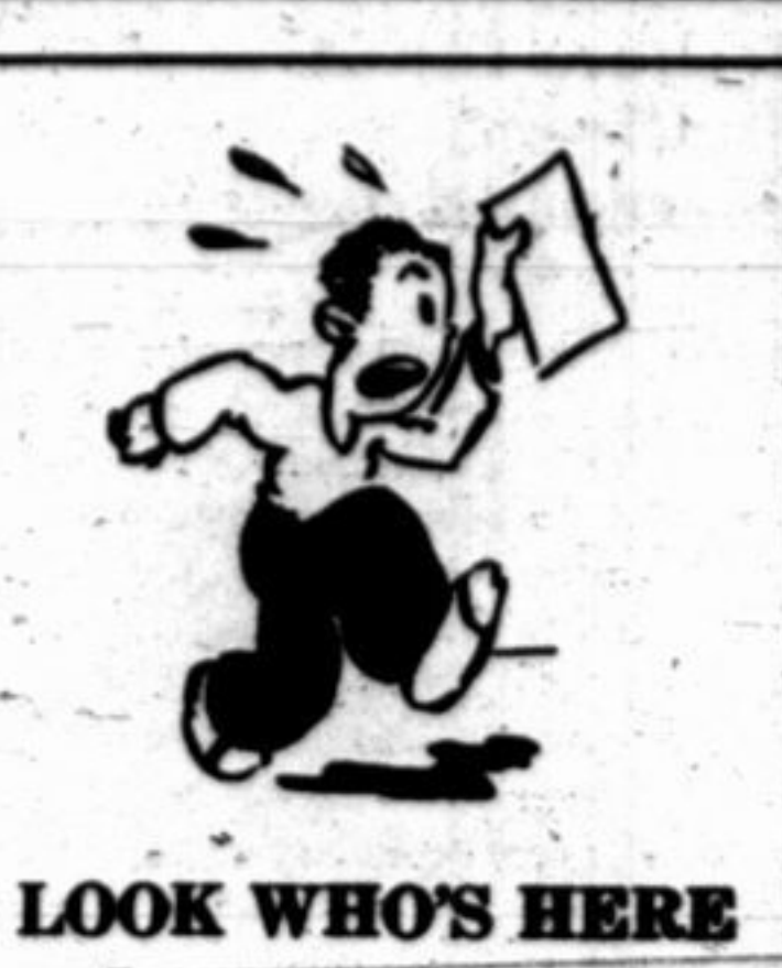
LOOK WHO'S HERE

The Highland Park High school baseball team will play the Evanston Wildkits tonight (Thursday) at Evanston.