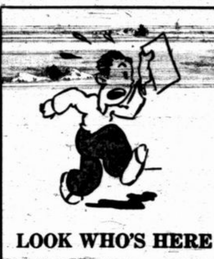
LOOK WHO'S HERE

Although the subject of his talk has not been announced, the Kiwanians and their guests are looking forward to the instructive and provocative views for which the speaker is widely known.