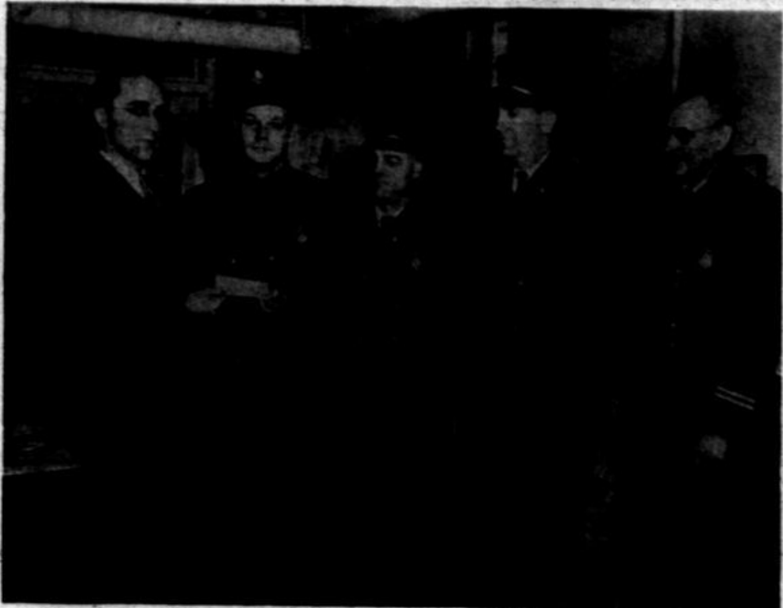
The Highland Park Fire Fighters' Association, local No. 822, recently pledged the sum of $500 to the Highland Park hospital for the purpose of furnishing one patient's room in the new addition to the hospital. The above picture shows a committee presenting a check for $250, the balance to be paid in the fall.