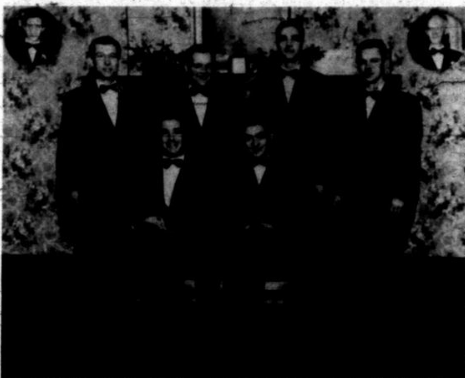
(Youngest Moose Degree Team In Competition)