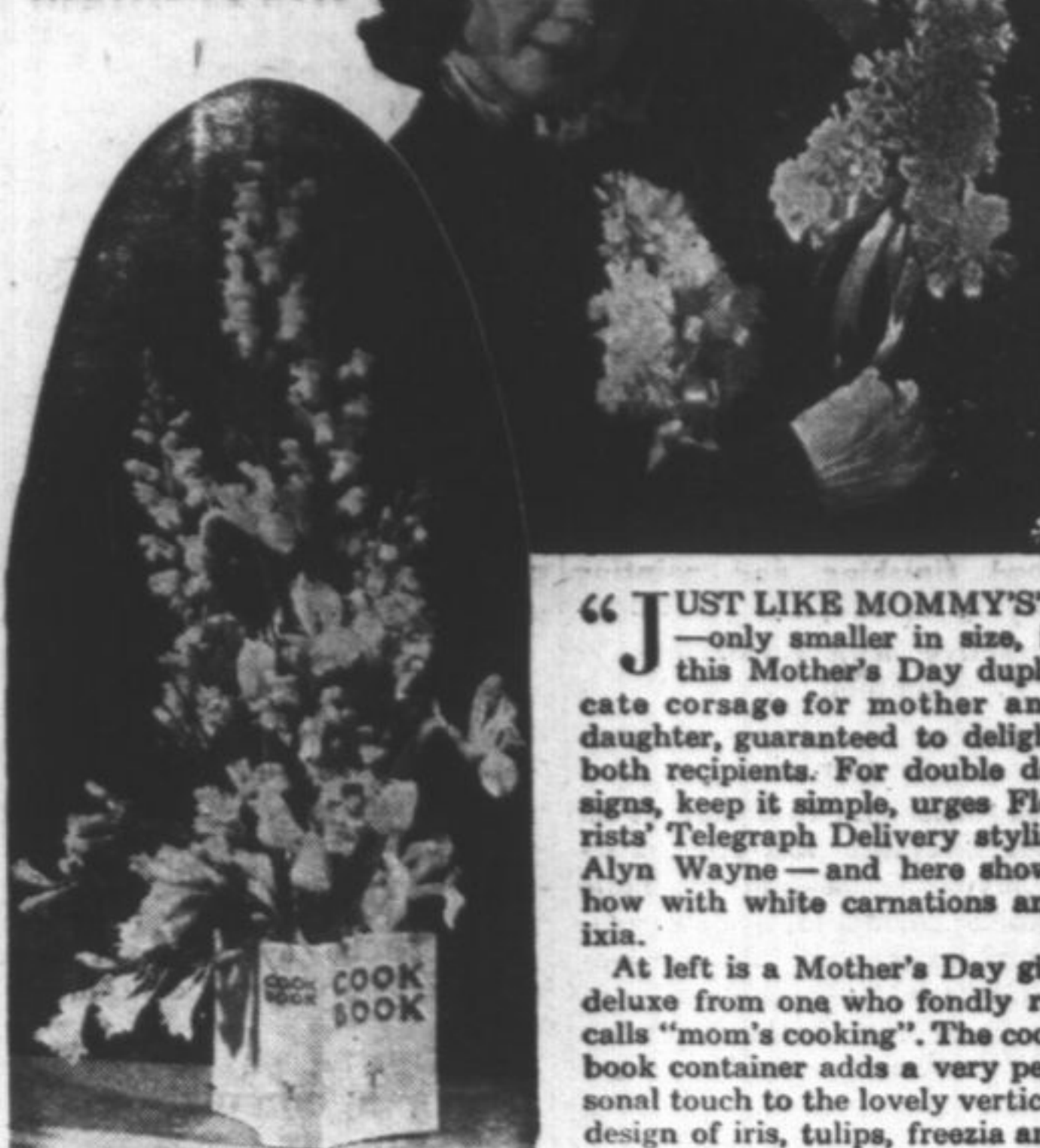
JUST LIKE MOMMY'S. Only smaller in size, is this Mother's Day duplicate corsage for mother and daughter, guaranteed to delight both recipients.

At left is a Mother's Day gift deluxe from one who fondly recalls "mom's cooking". The cook book container adds a very personal touch to the lovely vertical design of iris, tulips, freesia and snapdragons.