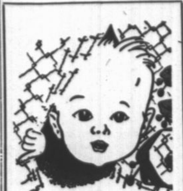
LOOK WHO'S HERE