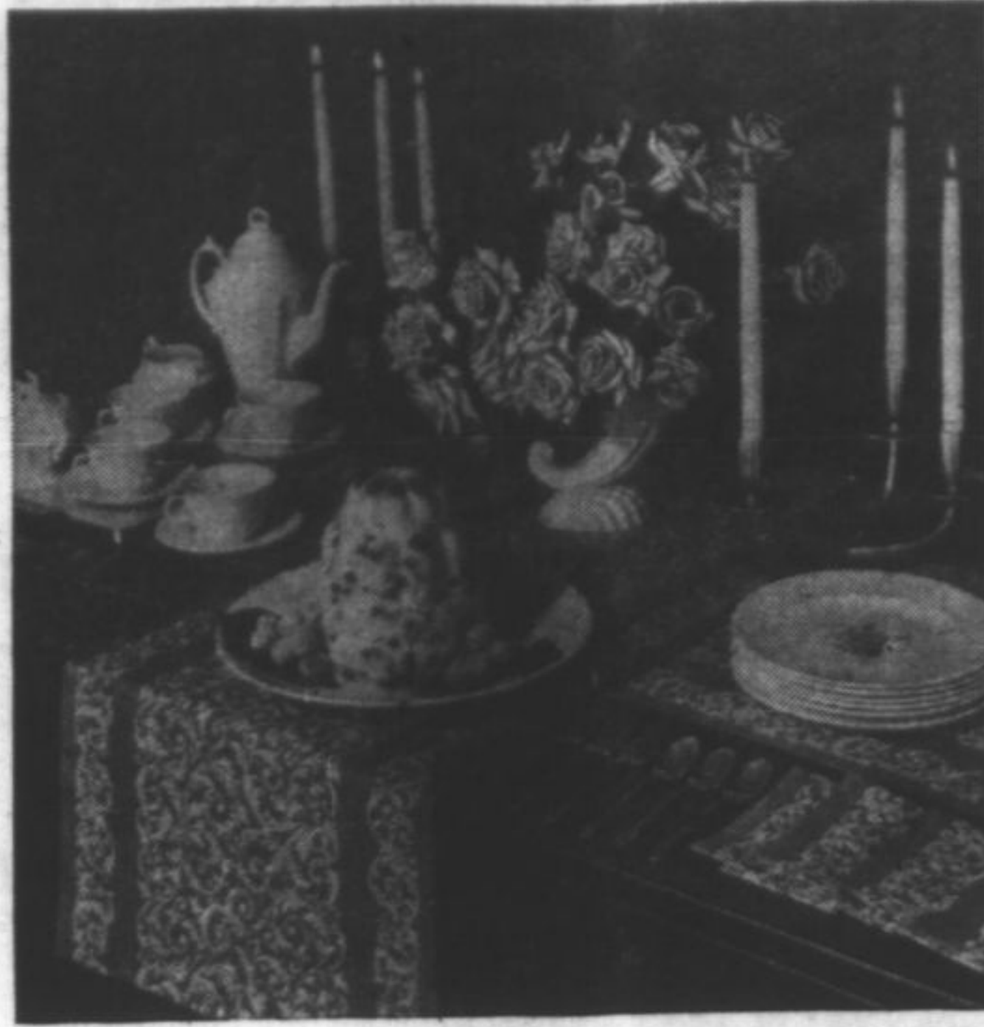
Full-blown roses in the white cornucopia container, complemented by white tapers, white Spode china, and criss-crossed Irish linen scarfs, make an aristocratic table setting for a dessert buffet during National Flower Week. The cherries and grapes in the moulded dessert also carry out the color scheme.