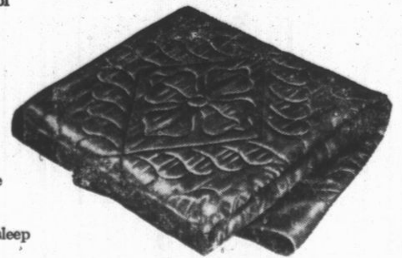
Westinghouse Electric Comforter—Choice of rose, blue and green quilted satin comforter with non-slip back, removable warming sheet, $49.95.*