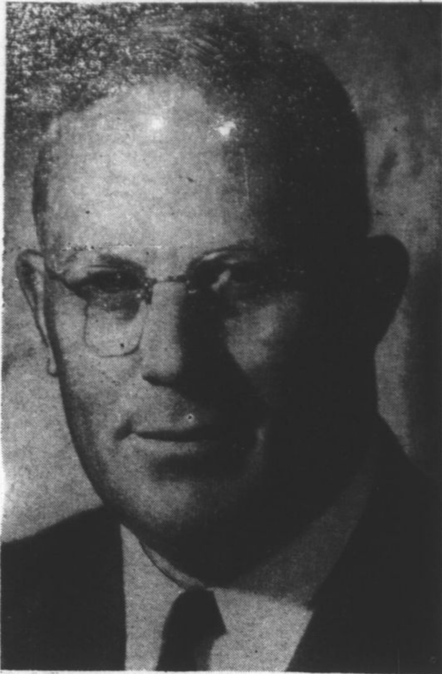
Governor Earl Warren of California, guest of Gov. Dwight H. Green, will be the principal speaker on Republican Day—Governor's Day at the Illinois State Fair, Thursday, August 19.