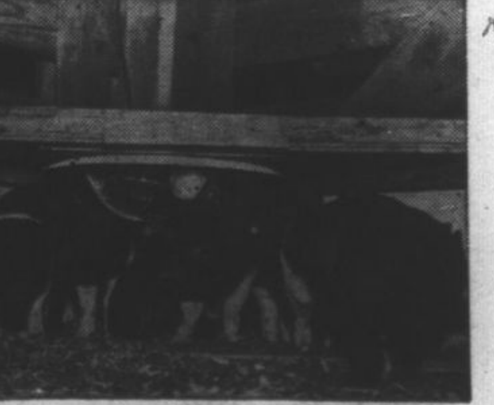
PORK PRODUCTION PROFITS begin of farrowing time! Electric pig-breeder help more pigs reach weaning age... help decrease the 33 1/2 per cent pig mortality rate, and send more pork to markets for sale and profit.

Forty per cent of America's farm output, in dollar value, is produced in—or within an overnight ride of—Northern Illinois. Chicago has become the hub of the world's greatest packing and food storage industry, as well as the largest single live animal market. Because the Middle West is the nation's granary, Chicago and Northern Illinois is a huge grain distributing center. As focal point for the nation's transportation network, the food wealth of the fertile upper Mississippi prairies and livestock from the western ranges flow into this area. Agriculture and industry are partners in Chicago and Northern Illinois.