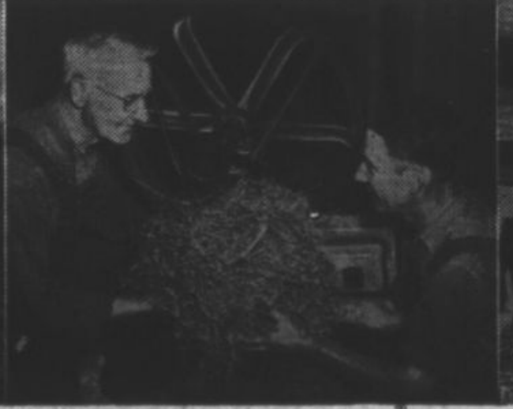
HAY DRYING SYSTEMS permit speedy drying away of leafy, green, high-moisture and plumb content hay... the kind that produces more milk. It is efficiently dehydrated by air forced through ducts in the mow.