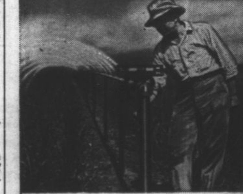
WATER when and where needed, and in the right amounts, is provided by "push-button" irrigation. Overhead, open ditch, or lightweight on-the-ground pipe systems make truck gardeners independent of the weatherman.