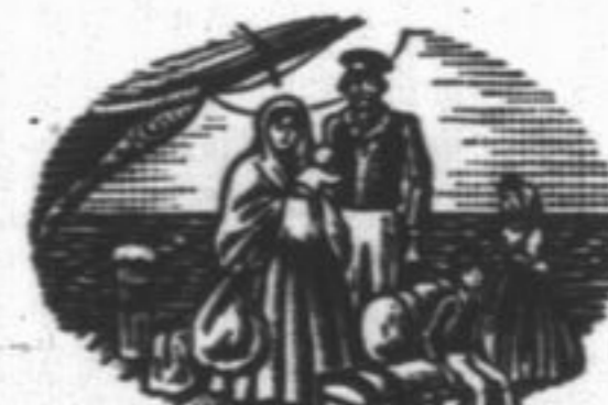
Immigration reached new heights with the need for workers on the Canal.