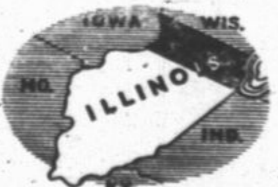
In 1818, Illinois became State. Boundary extended to include Chicago.