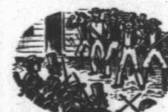
"Posse Comitatus" of Will County faces rioters at Ramo on July 4, 1838.