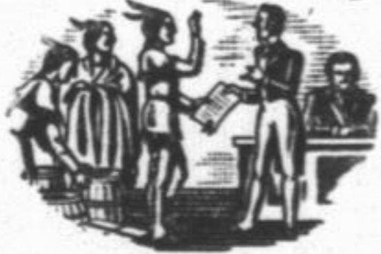
Indian Treaty of 1816 gave U. S. land along DesPlaines and Illinois.