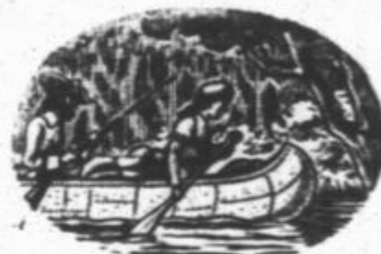
Marquette and Joliet made first known proposal for canal's construction.

As Entertaining As Your Favorite Magazine THE Service BULLETIN