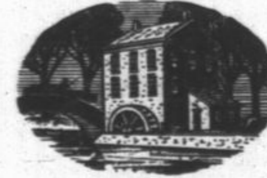
Cristalline, sawmills, runways take advantage of water power.