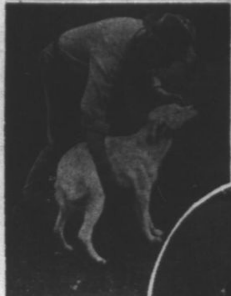
"WHO!" Picking the dog up and then planting him down firmly on all four feet while restraining him from moving is the best way to teach him to stop in his tracks on this command.