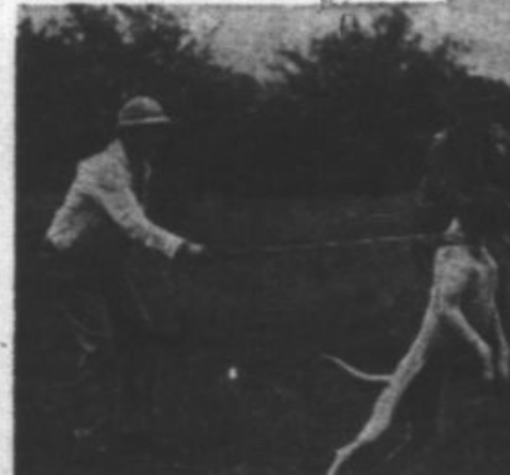
FIELD TRIAL DOGS are run in braces. Exuberant dogs have to be held back until they learn to stand without a lead while waiting for the starting signal.