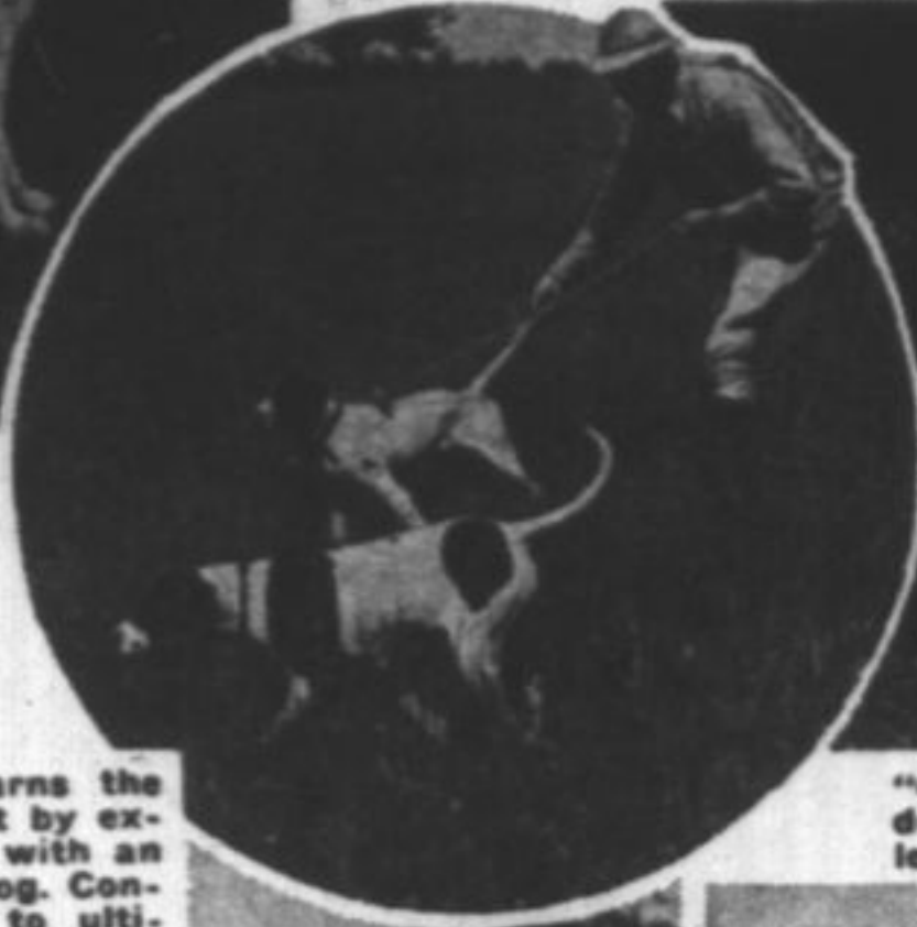
"COME!" is the first step in training a field dog. He learns from repeated tugs on a long lead and from pats when he obeys.