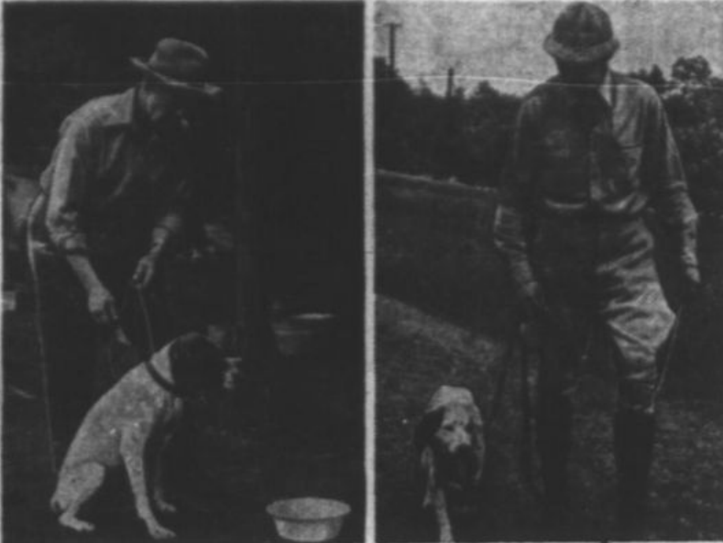
"NO!" is one of the most valuable commands in preventing waste motion in hunting. A dog who will refrain from eating when commanded "No!" is well on the way toward being well trained.

There's nothing like a good dog to add pleasure and profit to the hunt. But good dog companions don't just happen; practically without exception they are the products of long, conscientious training in the demands of the woods and fields. Some of the steps in the training of a good gun dog are here illustrated by Elias C. Fall, widely-known trainer of field dogs and director of the Gaines Research Kennels, Ridgefield, Conn.