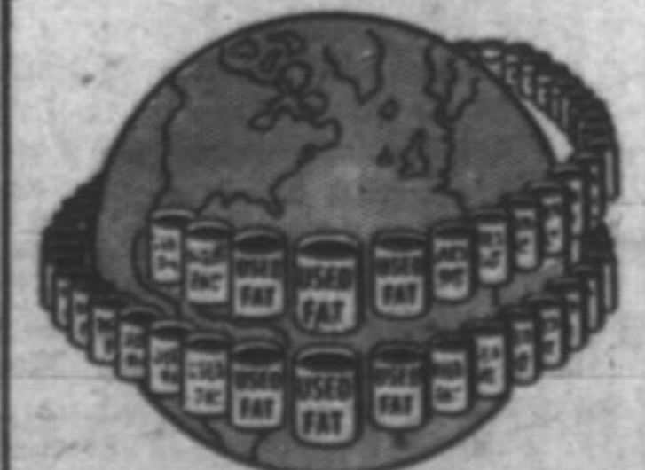
IN ONE-POUND CANS IT WOULD GIRD THE EARTH ALMOST TWO TIMES!

777,000,000 POUNDS USED FATS SAVED BY MRS. AMERICA IN PAST 4 1/2 YEARS