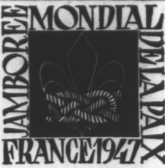
Insignia of the Sixth World Scout Jamboree at Moisson, France, Aug. 9 to 22, known as the "Jamboree of Peace."

Homewood, is a former Cub Scout and now a junior leader in Rotarian Troop 30. He is an Eagle Scout, has 27 merit badges, and has camped two seasons.