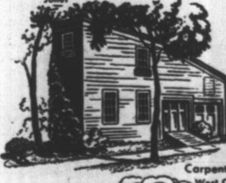
Carpenter Shop West Chicago