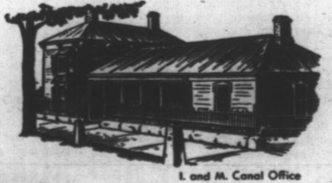
L and M Canal Office Lockport