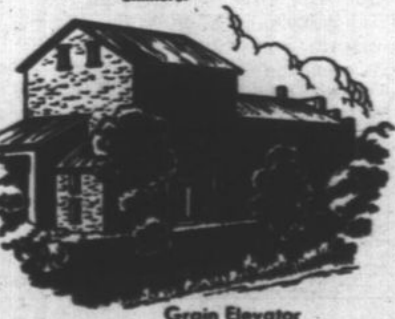
Grain Elevator Lemont