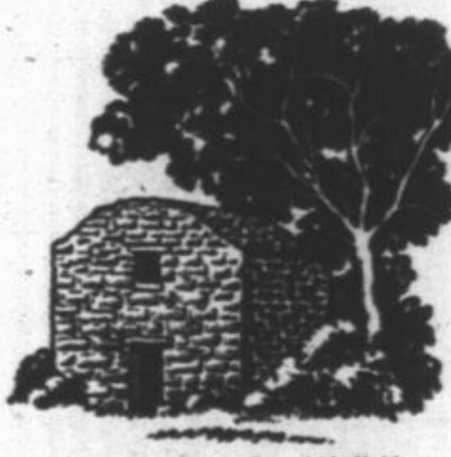
Artesian Well House Ottawa

As Entertaining As Your Favorite Magazine THE Service BULLETIN