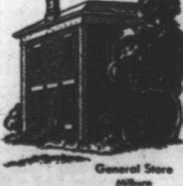
General Store Albion