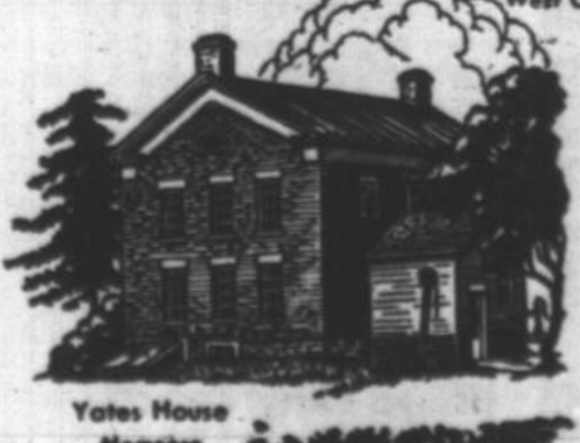
Yates House Monroeville