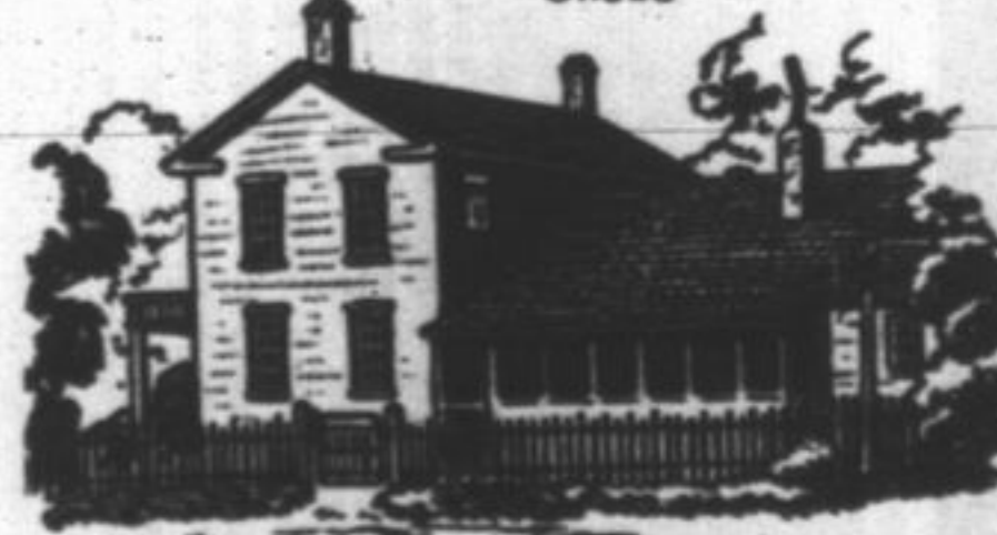
Gauger Homestead Joliet