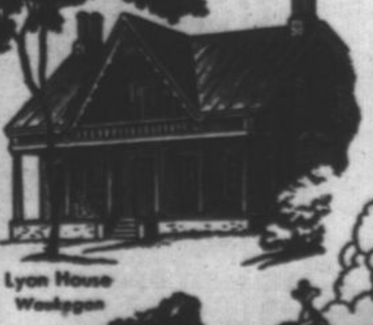
Lyon House Waukegan