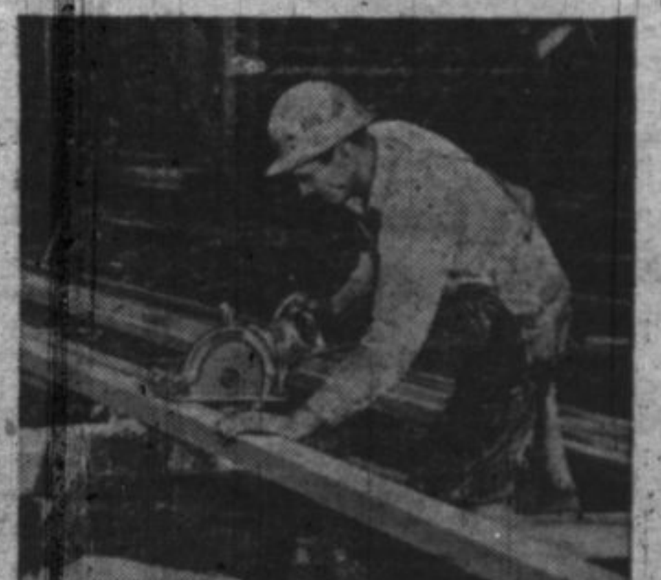
Portable Electric skill saws help to cut days from production schedules of minesweepers which are constructed almost entirely of wood.