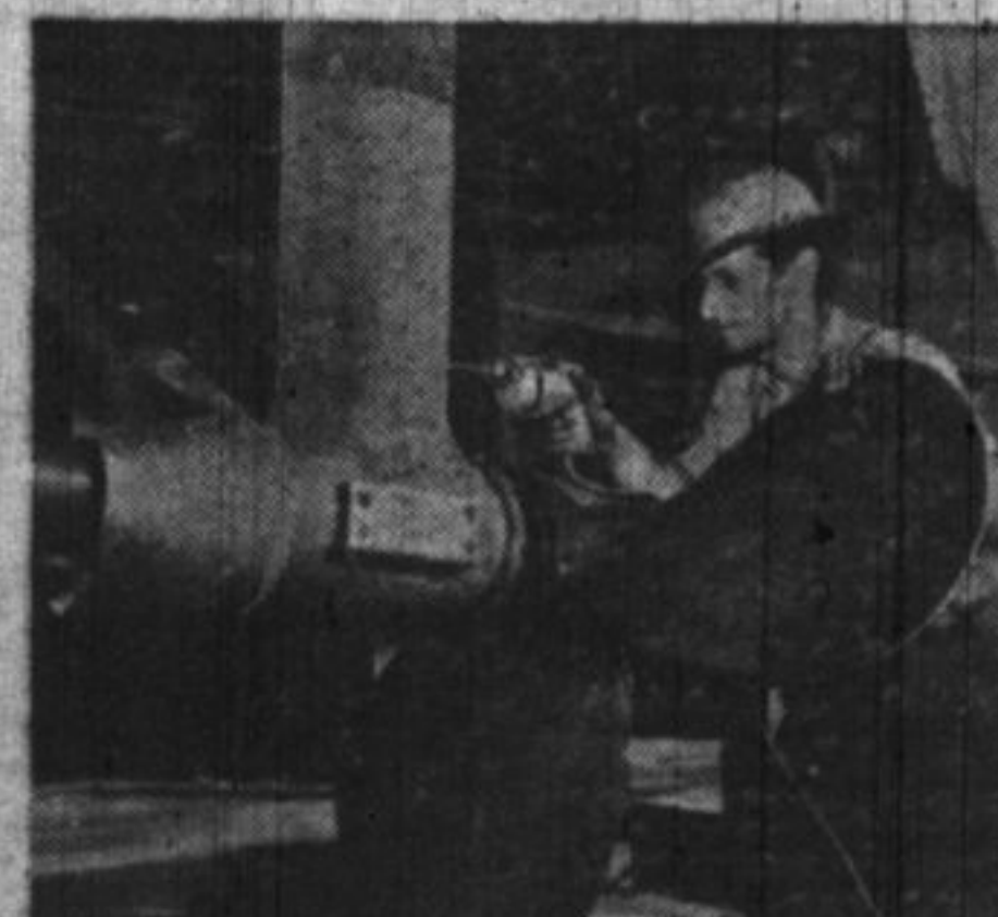
Electrically operated drills make quick work of boring holes. Like the skill saws, these portable drills can be carried to wherever they are needed.