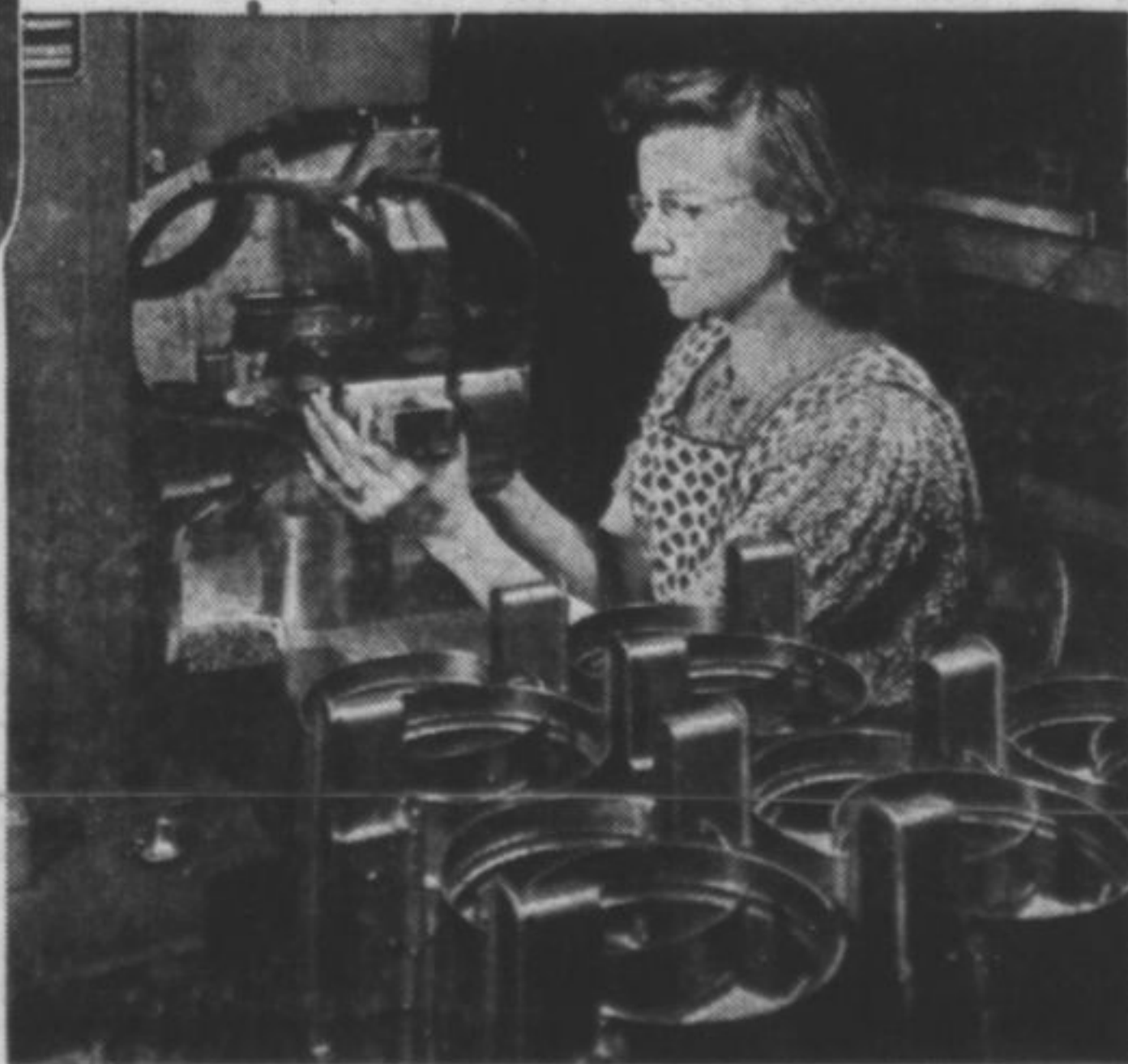
Electric riveting machine in a Northern Illinois war factory, speeds the assembly of the automatic feeding mechanism used on the cannon for our warplanes.