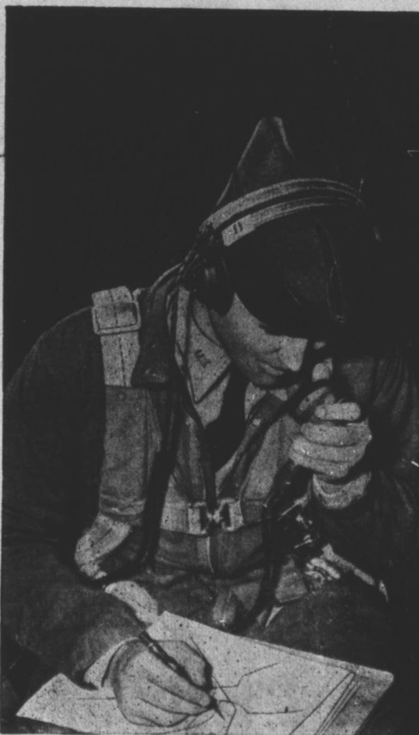
After checking the drift meter and plotting the data, the navigator transmits the information by telephone to the pilot of the plane who then sets the correct course.