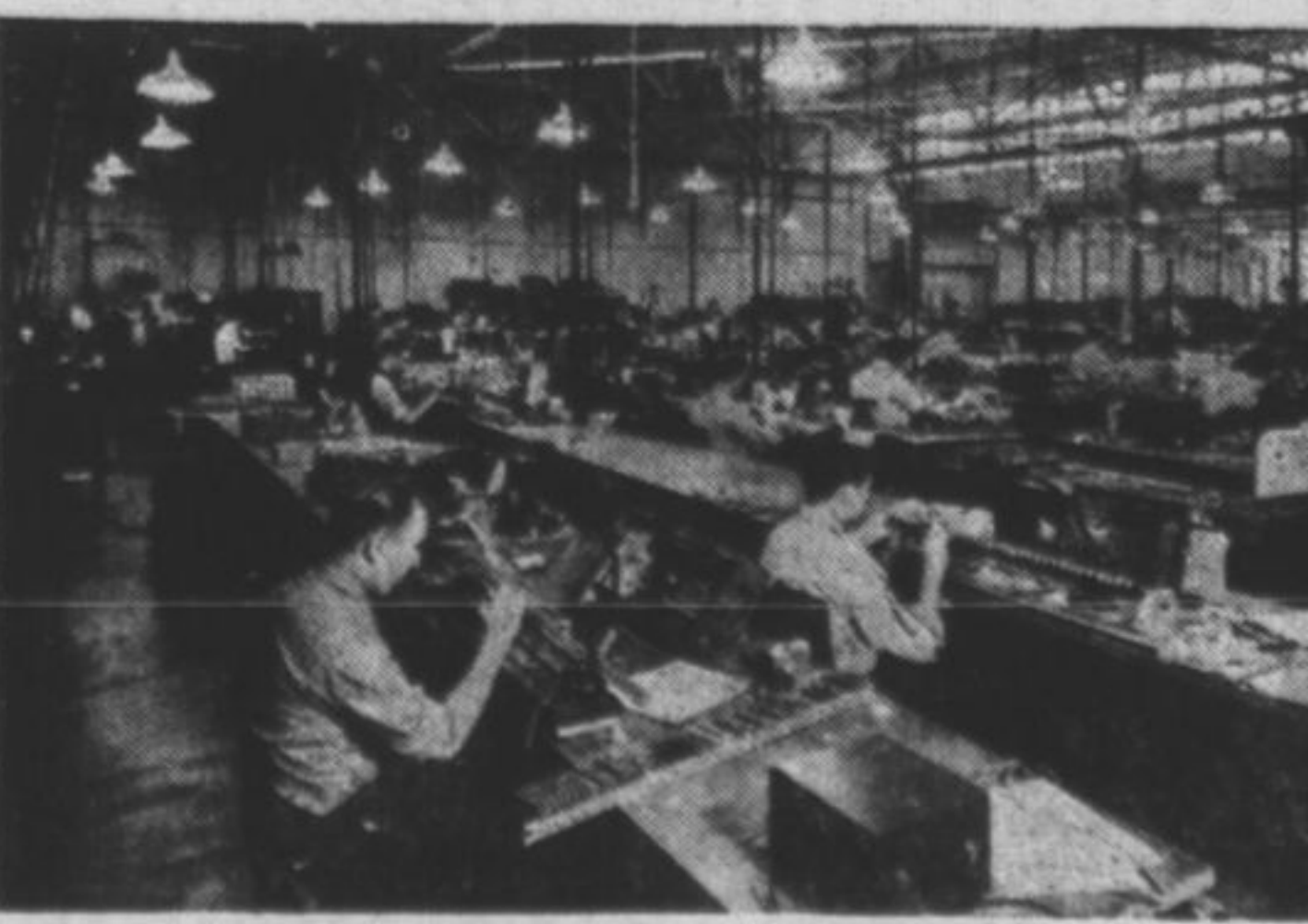
Electric precision testing machines are used in checking aircraft telephone equipment. Individual parts are tested before the complete telephone system is assembled.