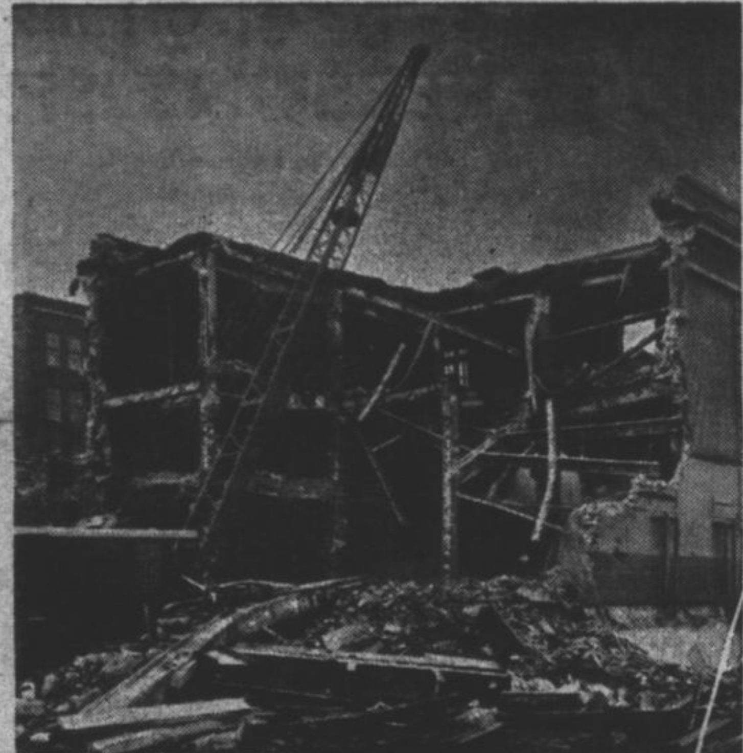
(Above) Demolition of old electric substation yields ton of scrap metal which will help to build a tank, a ship or cannon for our armed forces.