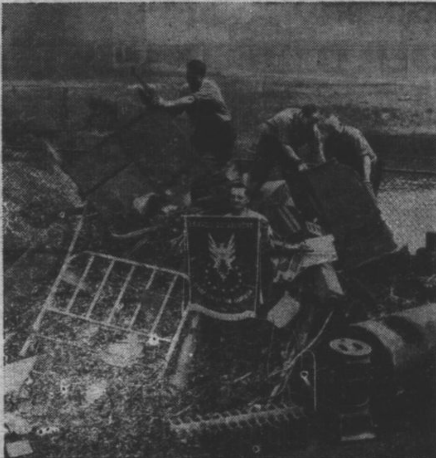
(Above) Interest among our employes has provided helpful cooperation in the scrap metal campaign.

167 Years OF FAITHFUL SERVICE U.S. MARINES Anniversary Nov. 10th