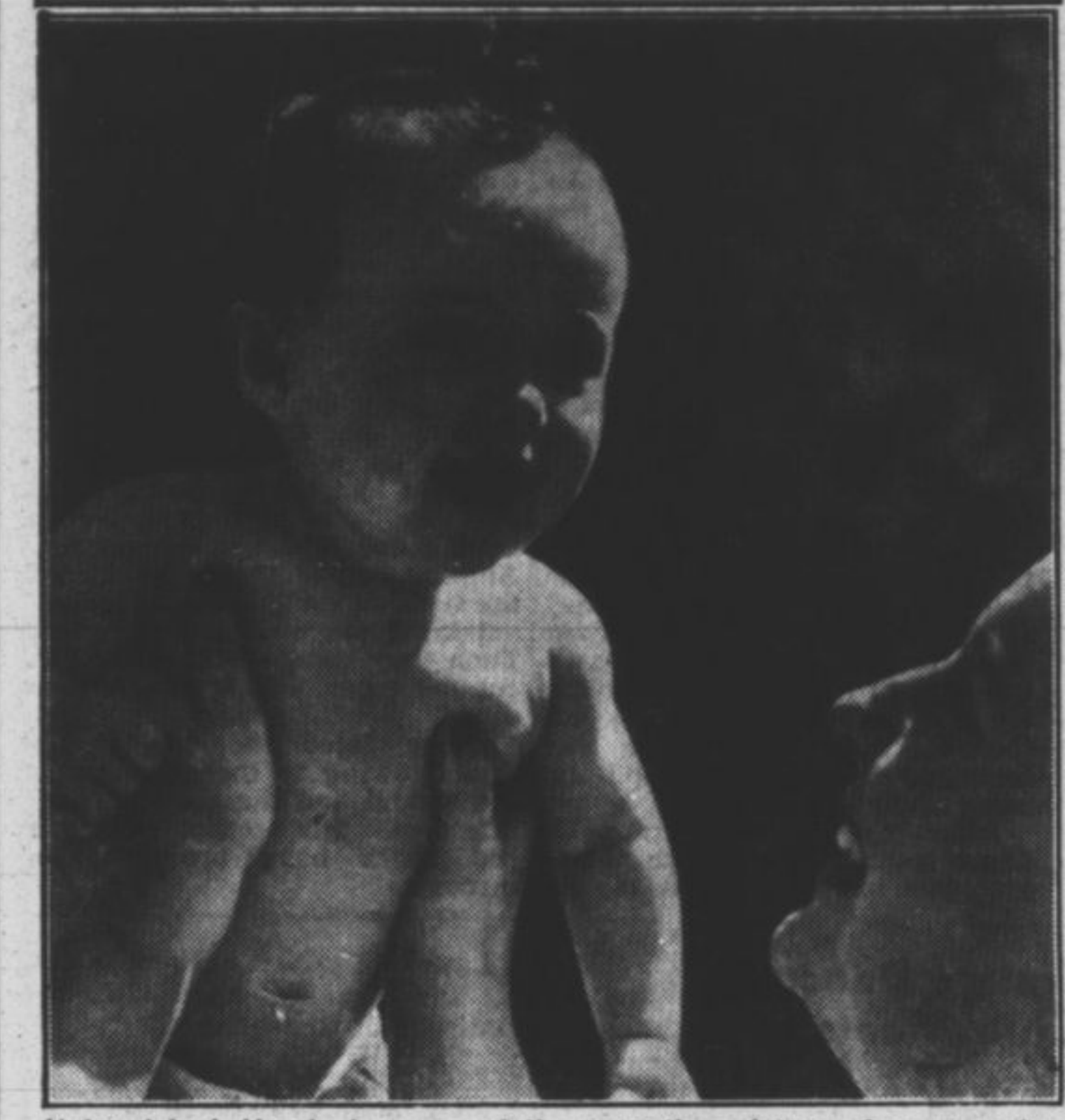
Up's-a-daisy! Here's just one of the appealing pictures from a series showing the big events in a baby's day. Picture series, you'll find, are a more interesting than just single shots.

PERHAPS I'm wrong, but I think the reason most amateur photographers don't try to make picture stories—or series of pictures—is that they believe they lack the necessary equipment, or subject matter. Well, let me kill such rumors right now. The truth is you can make complete picture stories with any camera if you'll just try. Furthermore, you don't have to have a spectacular subject to make a good set of pictures.