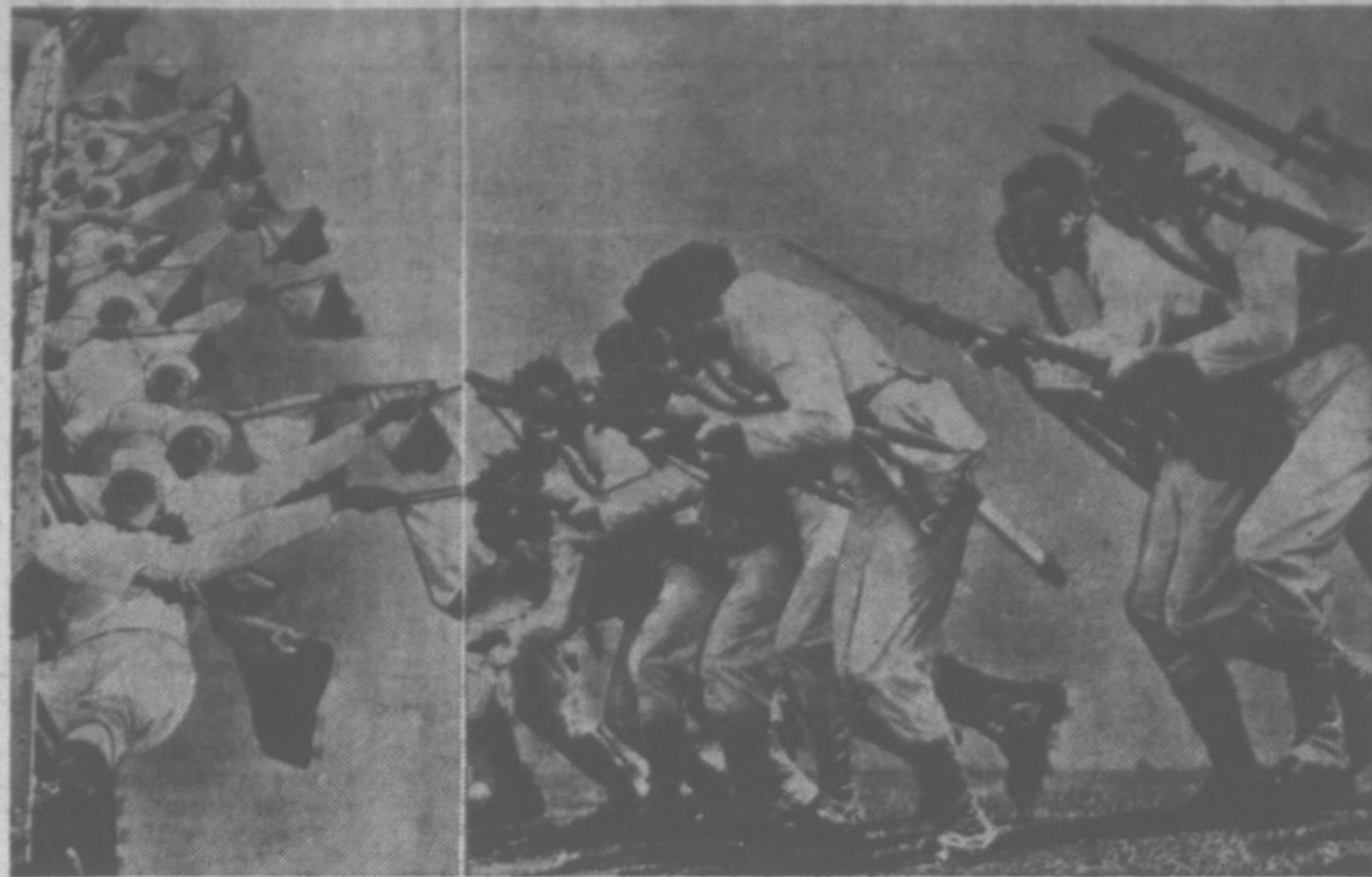
America's "first line of defense," the navy, takes very seriously to the business of training its men. In the above photo at right naval recruits at Great Lakes Naval Training station practice landing charge with fixed bayonets. At left, simulating conditions on the superstructure of a battleship, these advance course signal corps members go through paces clinging to a steel tower at the training station.

Vehicle tags for Deerfield for 1942 will be blue and white, oval in shape, with the modernistic deer in the center of the sticker. They will be available for purchase next December. At present the police are busy checking on those who have not purchased 1941 licenses.