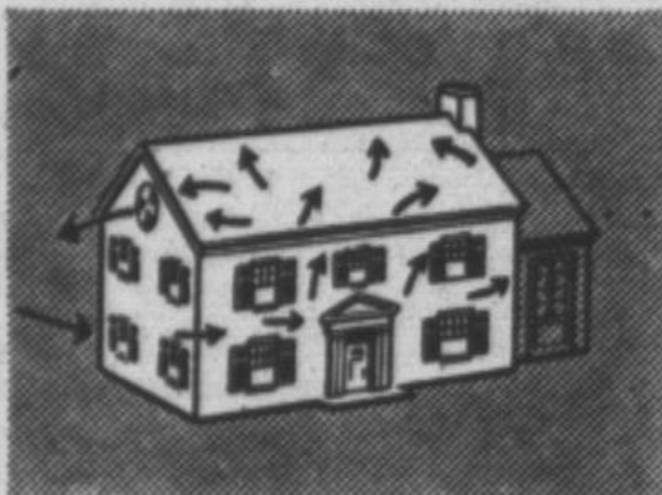
In 3 minutes or less, the air in every room has been completely changed.