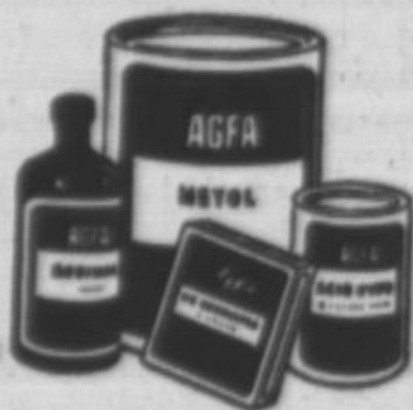
Complete Line of Fresh Photo Chemicals