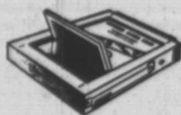
AUTOMASK PRINT FRAME A Superior Value at $1.50