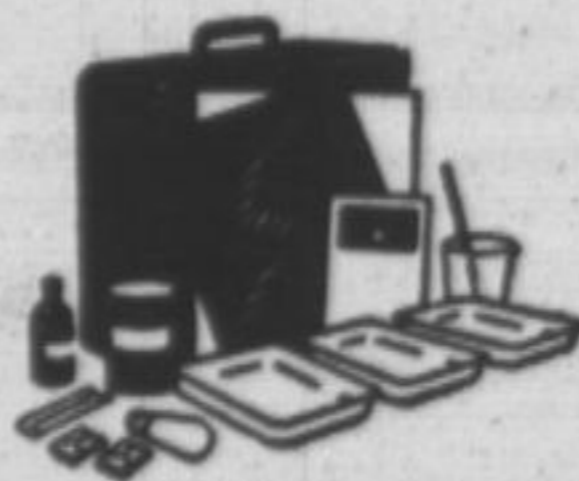
COMPLETE DARK ROOM OUTFITS From $1.95