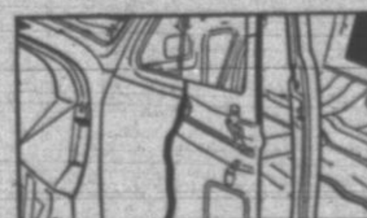
Double-Paneled Steel Doors

You ride in the body of your car as you live in the rooms of your home; and you ride in outstanding beauty, comfort and safety when you ride in a new Chevrolet with Body by Fisher!