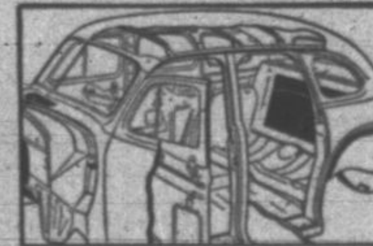
Ultra-Safe Unisteel Construction