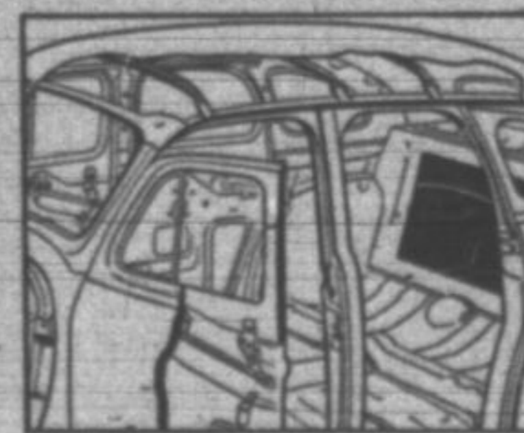
Solid Steel Turret Top