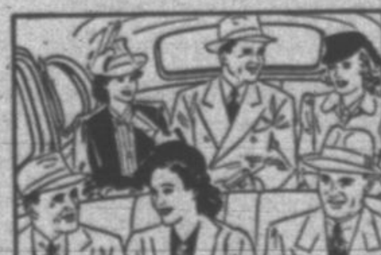
"3-Couple Roominess" in Sedans