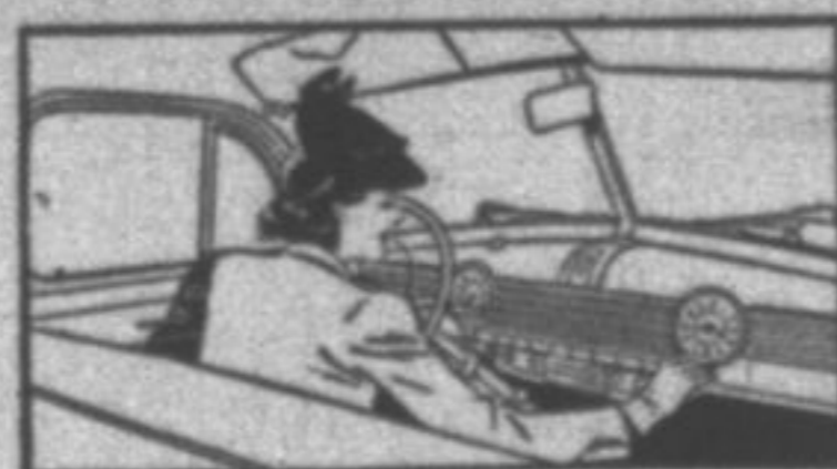
Style That's Outstanding