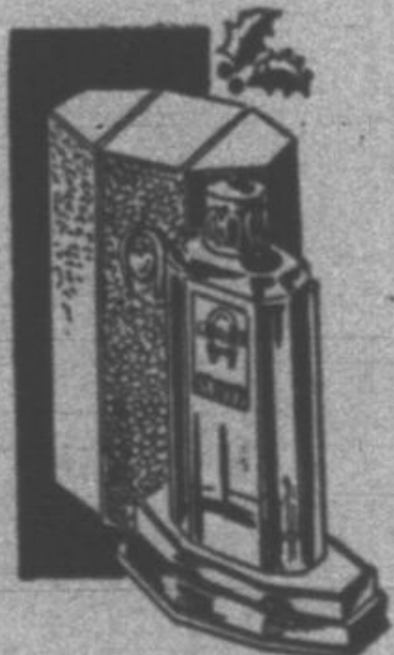
Perfumes $1.00 up