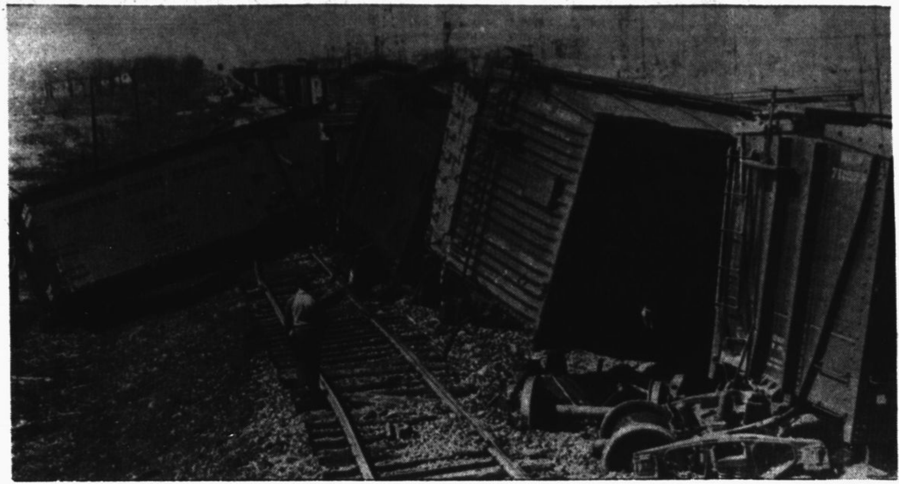
A broken wheel flange was believed responsible for the derailment of 15 cars of a 90 car merchandise train, which occurred last Friday afternoon on the Chicago and North Western Railroad freight line, west of Highland Park. In this picture are a few of the cars which were piled in rows across the tracks as they had been parked.