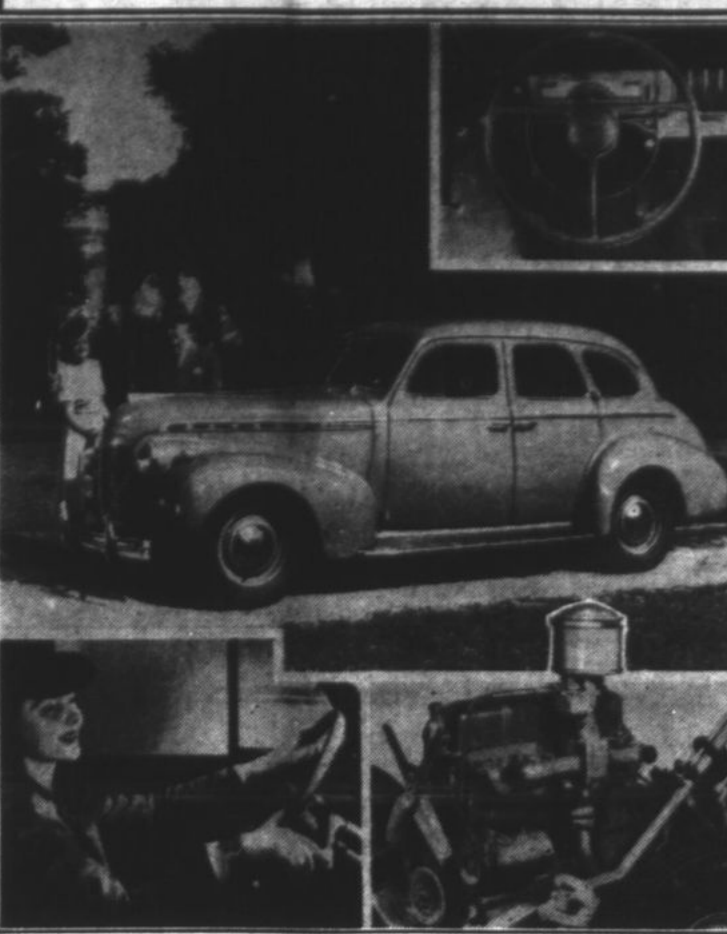
Three series of passenger cars, re-designed in the new "Royal Clipper" styling, and embodying numerous mechanical improvements to assure greater safety and comfort as well as finer performance, comprise Chevrolet's new line for 1940. All series are much larger, overall length being increased 4 1/2 inches. The new exclusive vacuum power shift (lower left) is now regular equipment on all models of all series at no extra cost. Special De Luxe series, the Sport Sedan of which is shown at center, has a new T-spoke steering wheel with horn-blowing ring (upper right). Lower right, the 1940 Chevrolet six-cylinder valve-in-head engine, which has been improved for smoother, quieter operation, and extremely long life.