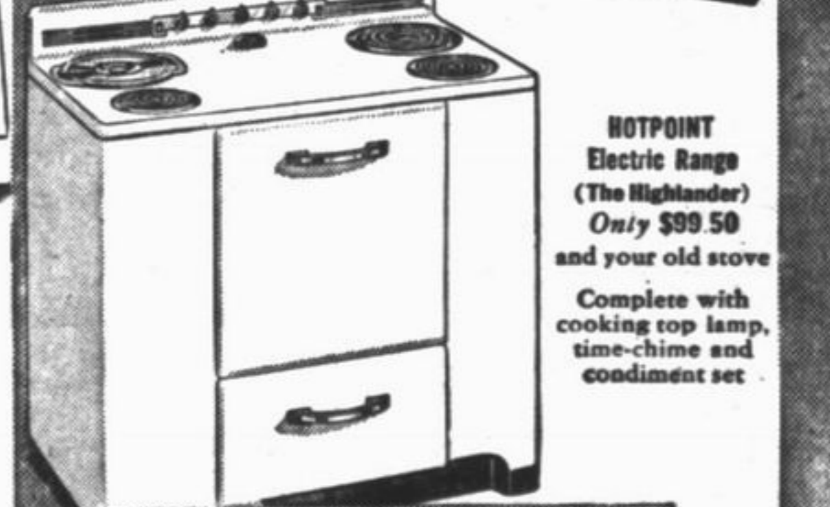
HOTPOINT Electric Range (The Highlander) Only $99.50 and your old stove

Complete with cooking top lamp, time-chime and condiment set.