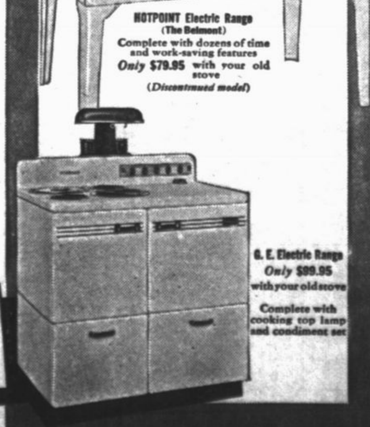
G. E. Electric Range Only $99.95 with your old stove

Complete with cooking top lamp and condiment set.