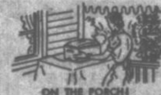
ON THE PORCH!

Prove these facts to yourself—in your own way—in your own home. Take advantage of our ONE WEEK HOME TRIAL AND DEMONSTRATION and use an Electric Roaster in the kitchen—on the porch—for picnics—any way you choose. You will not be obligated in any way... so act now!