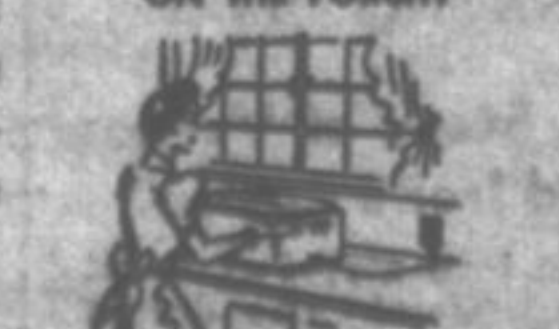
IN THE KITCHEN!