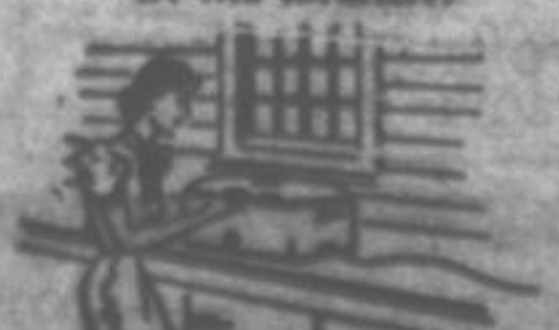
AT SUMMER CAMPS

Other appliance dealers are also offering fine bargains in Modern Electric Roasters.