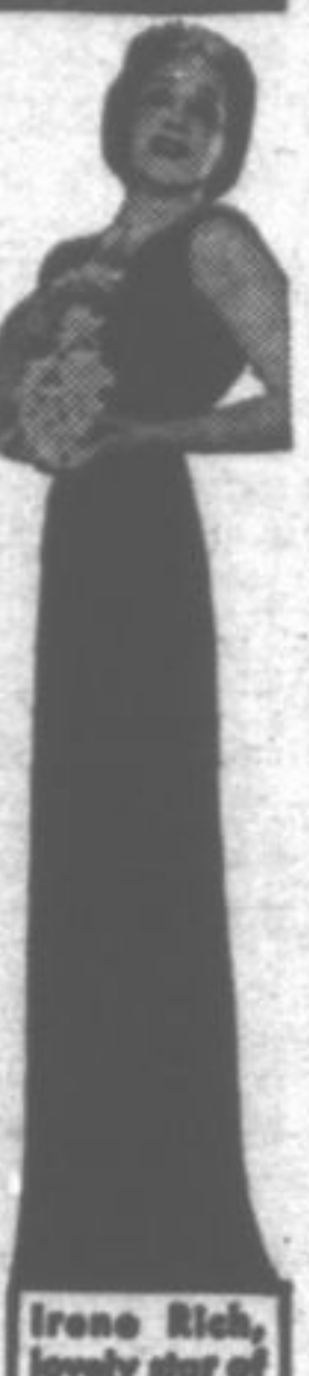
Irene Rich, lovely star of the screen and radio, now past 40, weighs the same as she did at 16.