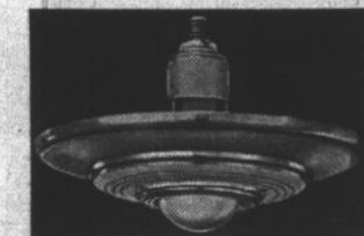
Sivray Sight-Saver... Modern, attractive fixture that screws into ordinary light socket. Expensive in appearance. $2.45