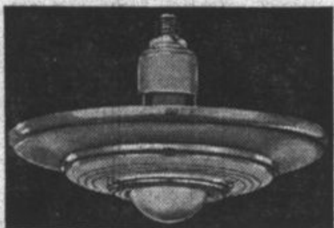
Sivray Sight-Saver... Modern, attractive fixture that screws into ordinary light socket. Expensive in appearance. $2.45